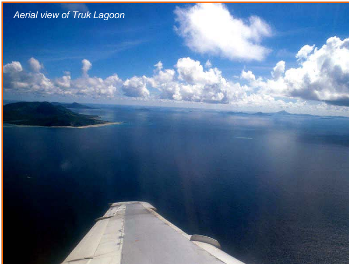
Aerial view of Truk Lagoon

The resort has a restaurant offering local and Asian Cuisine, inside & outside bars, a conference room and gift shop. Sea kayak rentals are available & the hotel can arrange visits to the distant atolls for snorkelling & fishing trips. For family members or friends who are non-divers, the World War II history filled island has a taxi service and private tour buses that offer visits to historic and cultural sites. Located on the grounds of the Blue Lagoon Resort is the local dive operator, Blue Lagoon Dive Centre. The dive shop is air-conditioned and provides sales, service & classes.