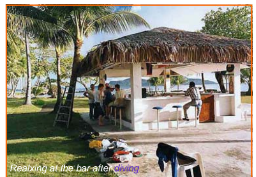
Relaxing at the bar after diving

When you experience the mystery and excitement of the Fujikawa Maru with its beautiful soft coral growth and schools of colorful fish or descend into the cargo holds of the Sankisan and San Francisco Maru you will understand why the license plates in Chuuk call it "Divers Haven." With over 40 wrecks to dive you will want to extend your trip