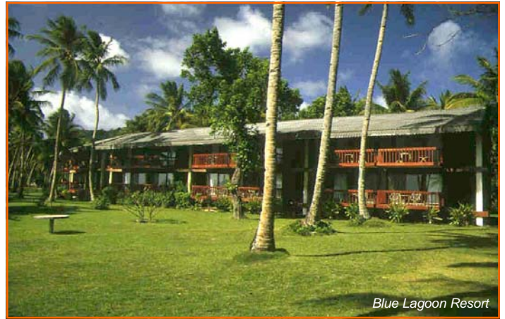
Blue Lagoon Resort

The resort has a restaurant offering local and Asian Cuisine, inside & outside bars, a conference room and gift shop. Sea kayak rentals are available & the hotel can arrange visits to the distant atolls for snorkelling & fishing trips. For family members or friends who are non-divers, the World War II history filled island has a taxi service and private tour buses that offer visits to historic and cultural sites. Located on the grounds of the Blue Lagoon Resort is the local dive operator, Blue Lagoon Dive Centre. The dive shop is air-conditioned and provides sales, service & classes.