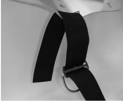
Pic. 2. (front view)

2) Thread the same end through the back plate's bottom horizontal slot from the front with the D-ring facing backward (Pic. 2) then back through the WK-4 keeper (both slots – Pic. 3) to complete.