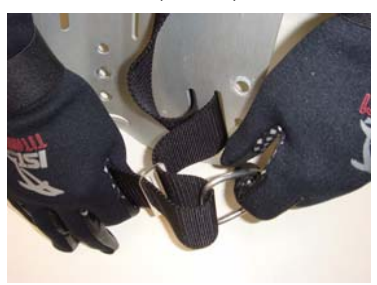
Pic. 14. (front)

Thread a webbings through an opening of a WK-4 webbing keeper, then a DR-2 flat D-ring and 7) finally back through the webbing slide's vacant opening in the opposite direction (Pic. 14). Repeat the same procedure with the other end of the webbing to complete the installation of the basic harness (Pic. 15).