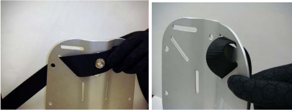
Pic. 1. (back)

1) Insert one end of the basic harness webbing from the back through the angled slot near the top of the plate (see Pic. 1) then continue on through the adjacent top slot (from the front of the plate - see Pic. 2).