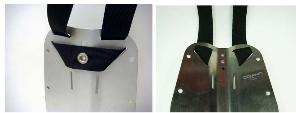
Pic. 3. (back)

2) Repeat the same procedure with the other side and remember to centre the grommet against the plate's ridge (don't worry about lining the holes up too precisely at this stage).